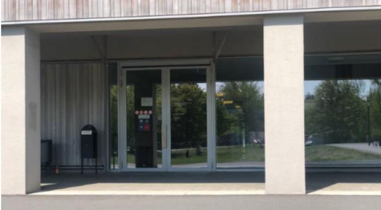
Image 4: Entrance to the building_ Image source: Freie Universität Berlin

Take the entrance marked in black (see image 2). You will need to walk about 100 meters along the building (see image 4). Then go through the entrance and walk to the middle of the building and take the middle stairs/elevator.