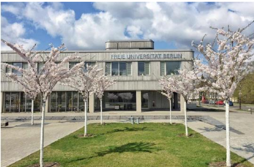
Image 1: Holzlaube ("wooden cottage")

The conference rooms (from room - 1.2009 in the basement to room 2.2059 on the 2nd floor) are located in the Holzlaube ("wooden cottage"). The Holzlaube is located on the Dahlem campus, Fabeckstr. 23-25 (see image 2) and looks like this: